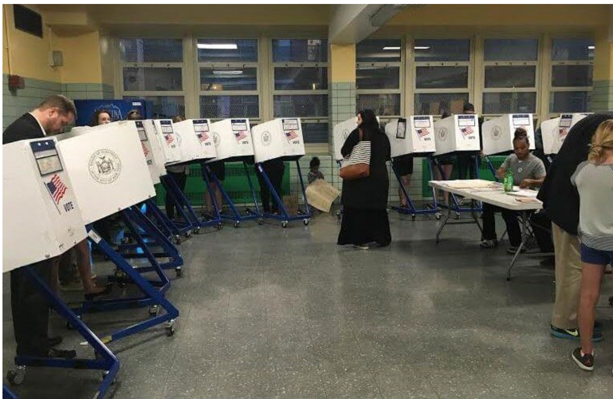
Early voting during 2019 General Election at a school in Bay Ridge, Brooklyn.

In addition, the State Board of Elections provides large print copies of the NYS voter registration form as well as a poster-sized version of the agency-based voter registration form to agencies and programs participating in the NVRA program that serve people with disabilities upon request.