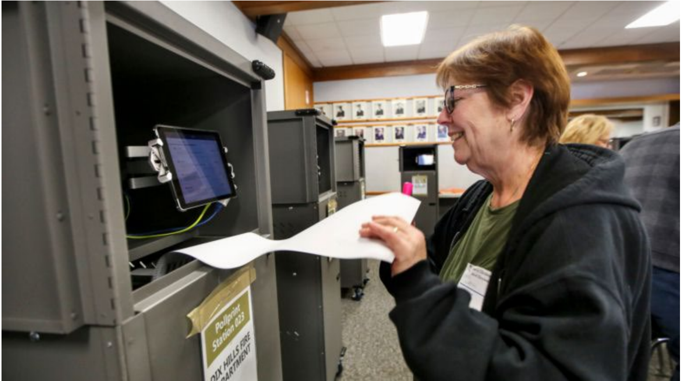
A woman in Dix Hills receives a ballot printed-on-demand during early voting.