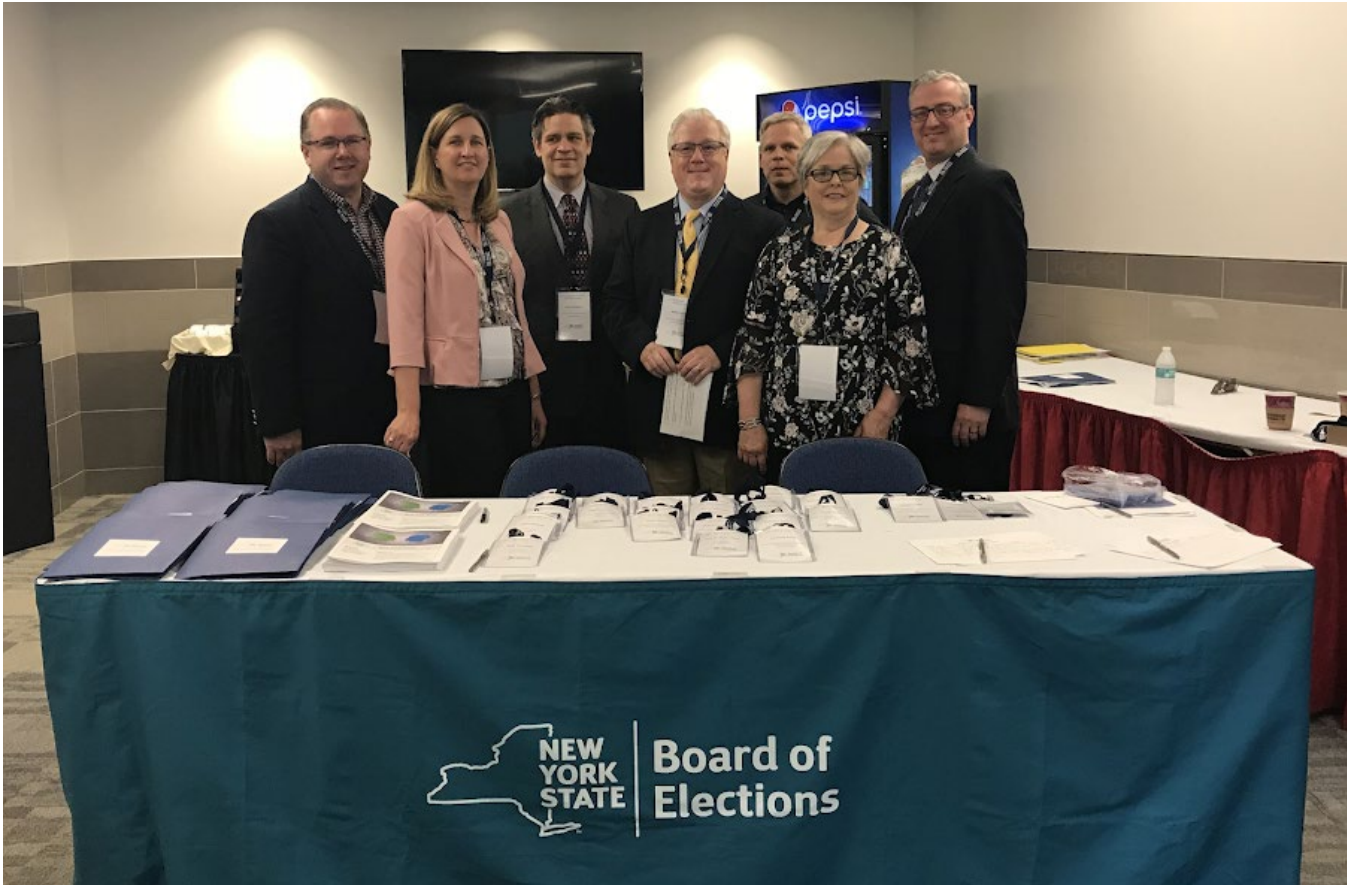
The State Board participated in a tabletop exercise with the US Department of Homeland Security at the Times Union Center