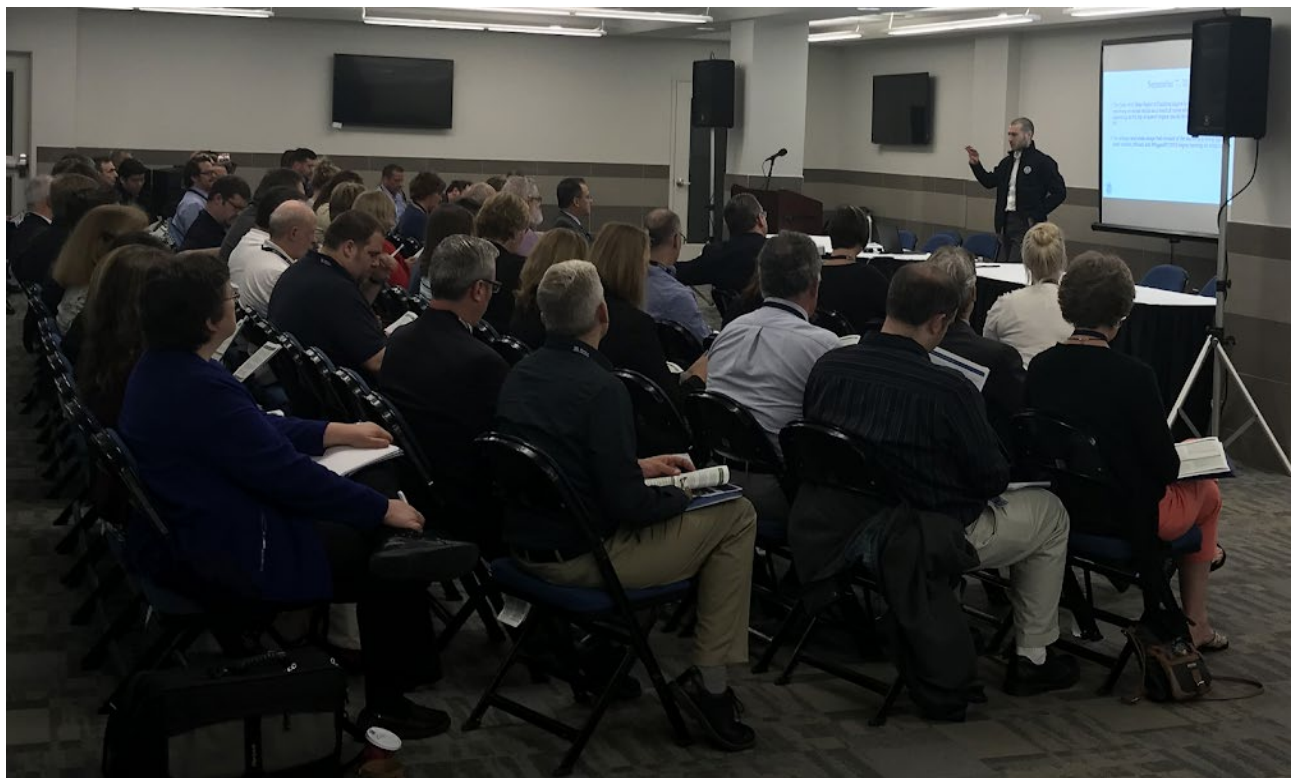
A representative of Homeland Security conducts the Albany Regional Tabletop Exercise

“Elections” as an activity has been declared a critical infrastructure by the United States Department of Homeland Security creating a higher target profile to which the state has responded. The State Board has partnered with the Center for Internet Security and facilitated all county boards to join the Multi-State and the Elections Infrastructure Information Sharing and Analysis Centers.