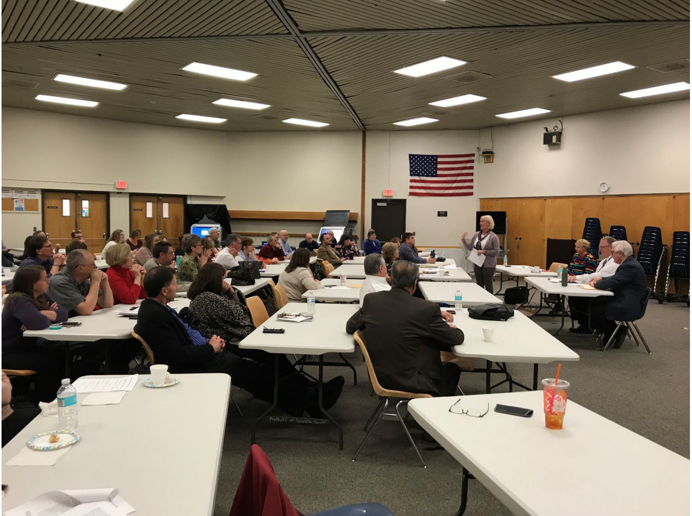
Commissioners from upstate attend a voting machine demonstration at the Saratoga Board of Elections.

To receive reimbursement, County Boards of elections must have contracts in place, and submit an application packet to the Public Information Office / Grants Unit. In 2019, eleven counties submitted 31 vouchers for SHOEBOX fund reimbursement, amounting in total to $226,547.48.