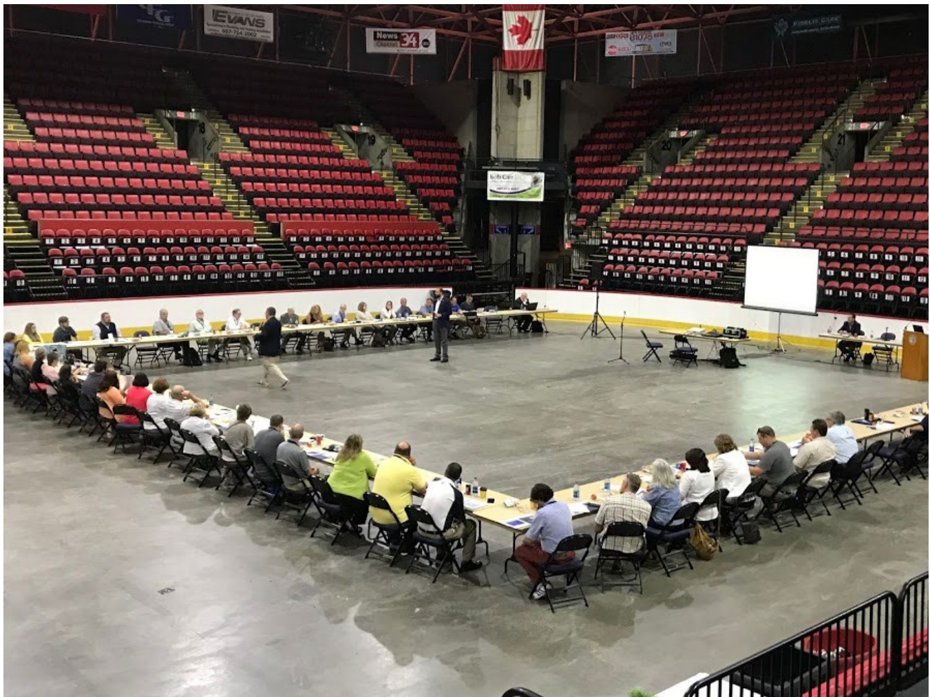
The Binghamton tabletop exercise was conducted at the Floyd Maines Veterans Memorial Arena with state, local and federal partners.

The Information Technology Unit has also completed the development and implementation of the new NYSBallot (pronounced “nice ballot”) system in support of the Military & Overseas Voter Empowerment Act (MOVE). The previous MOVE system, hosted by a third-party vendor, was implemented in 2012 to assist military and civilian voters who live overseas to vote absentee ballots.