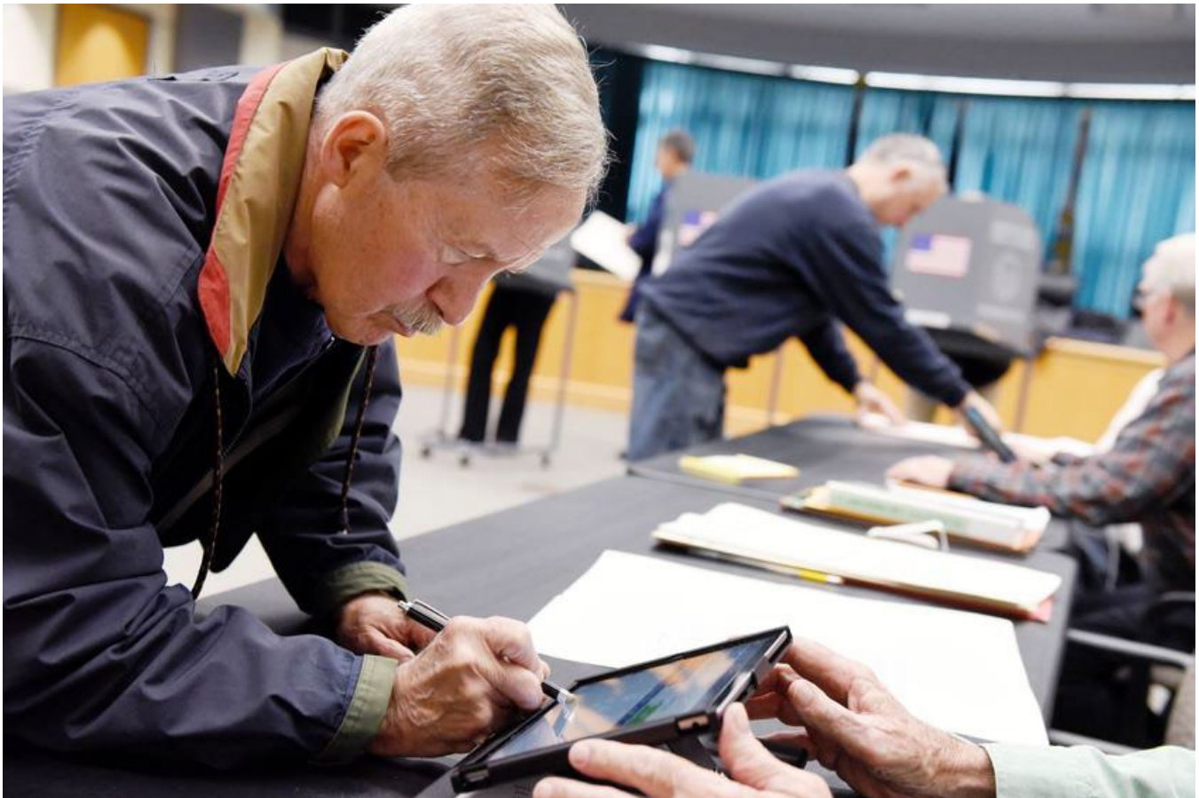
A voter uses an electronic poll book during early voting.

For counties that implemented an EPBS, a network security checklist was required to be completed for each unique network configuration used by a county, showing compliance with all applicable security requirements.