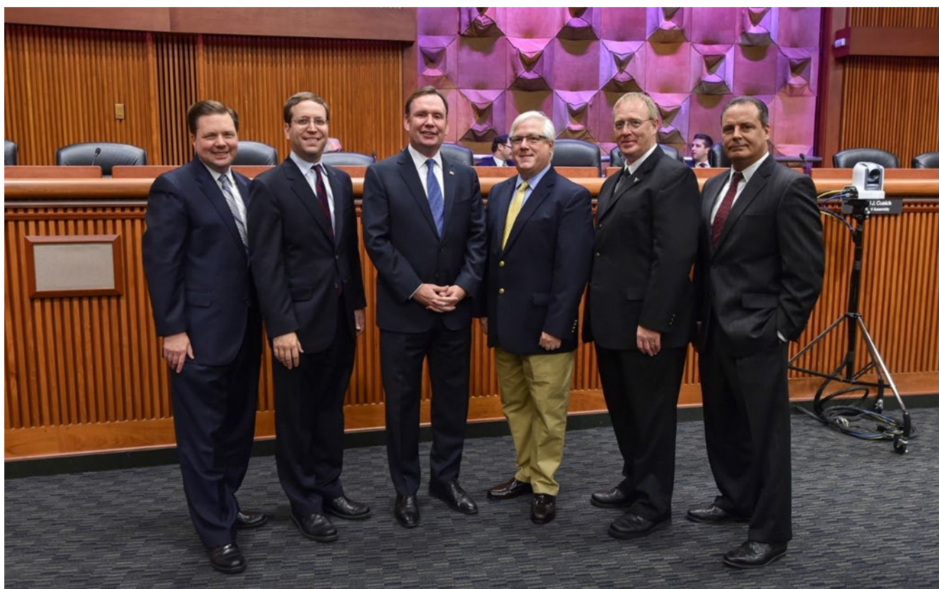
Executive Staff testified before New York State Assembly Standing Committee on Election Law, November 18, 2016.

Counsel's Office, in consultation with the executive staff, regularly monitors all legislative action which could impact the Board and the election process in New York. Such activities include attending legislative committee meetings, responding to inquiries regarding legislation, and responding to requests for comments on legislation. In addition, Counsel's Office is responsible for drafting all legislative proposals of the Board. In addition to any New York State legislative initiatives, the office has worked extensively with other members of the staff in reviewing any federal legislative proposals that may influence elections in New York.