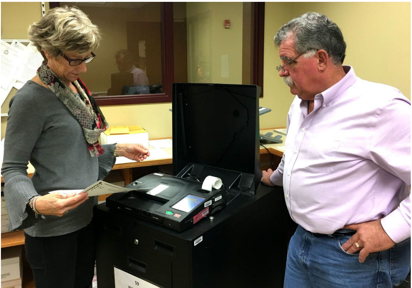
Warren County election officials demo a voting machine.

Westchester County – last day to file petitions of designation or petitions of nomination, the BOE shall remain open between the hours of 9:00 am and midnight to receive said petitions.