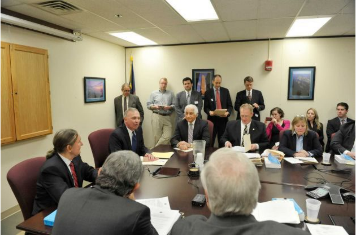
Board of Commissioners meeting