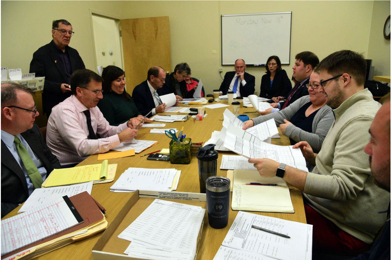
Ulster County election officials count ballots in 2019 with onlookers.

Provides that a local board of elections shall cast and canvass voter's affidavit ballot if it substantially complies with law.