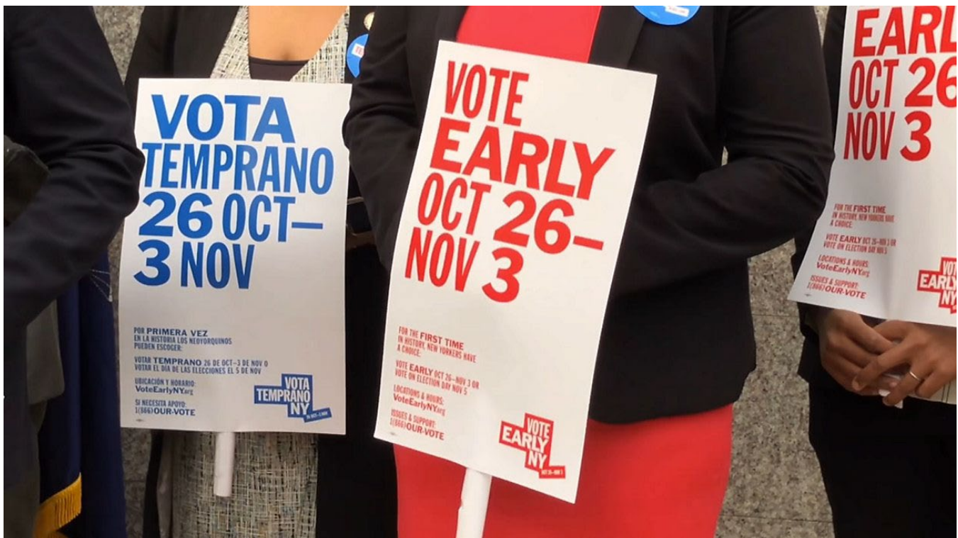
People holding signs promoting early voting for the first time in New York State.

Provides for nine days of early voting before each primary, general and special election conducted by boards of elections, excepting village elections.